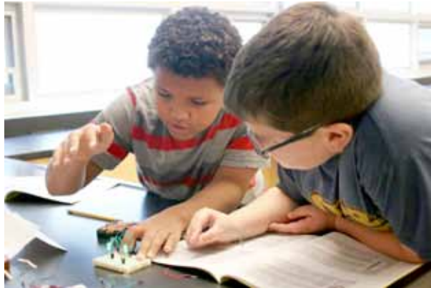
Students use an electronic breadboard to bring electricity to light bulbs.

Students from across the district showed their creativity and talent at the first STEM Camp, which was held in June for students entering grades 4 through 9. Throughout the week, students learned to program robots, create 3Dprinted materials, work with an electronic breadboard to power up lights and more. At the end of the week, students had to put all of their new tools together to create amusement park rides. More than 170 students attended the camp, which was free and included lunch from local business. Thirteen teachers helped to design the curriculum for the week and led instruction.