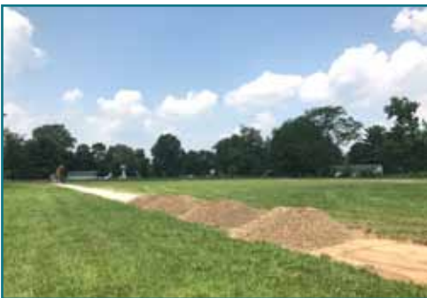
Hillview walking track under construction in July.

This upgrade to the field benefits many programs at Newark City Schools, including soccer, lacrosse, marching band and football. The renovation has been a tremendous partnership between private donors and the district. Thank you to everybody who has contributed to its success.