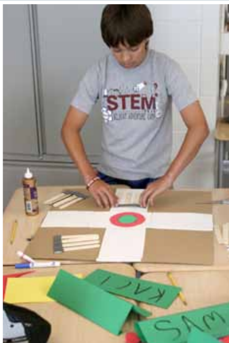
A student works on an idea for improving the Church and 21st Street intersection during the second annual STEM Camp this summer.