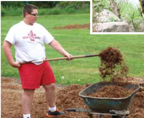
A member of the Wildcat boys soccer team helps spread mulch at Levin Park.