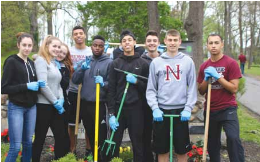
Members of the Wildcat boys' and girls' basketball teams helped weed and plant flowers at the entrance to the NHS campus.