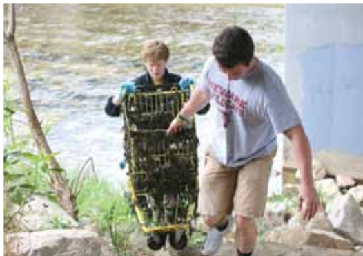
Key Club members picked up trash along the bike path and river, including this shopping cart that was pulled from the river.

Thank you to the City of Newark's Parks Department for assisting the school with materials for the annual event.